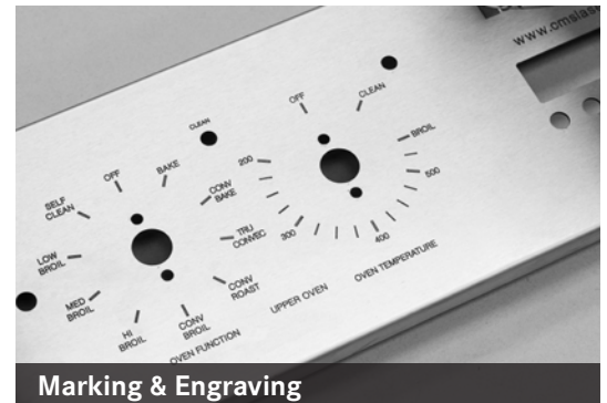
Marking & Engraving

Direct part marking on appliance parts made of metal, glass, plastic or other materials. Mark user control information, manufacturer identification, safety warnings, quality control, product tracking, serialization and dates. Create graphics, logos, text, barcodes, and data matrices.